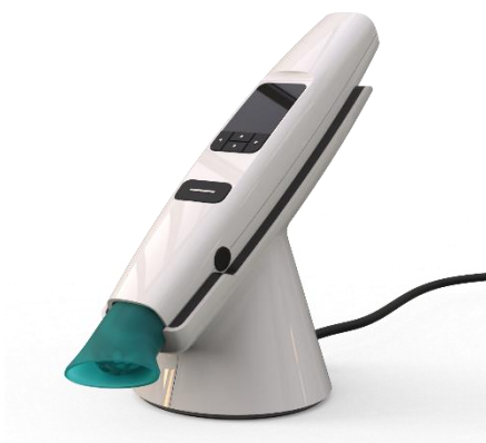
Figure 2: ViroCAP® System of Viromed