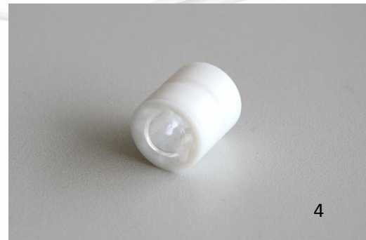
Picture 2: Nozzle caps for various applications. (1,2) Needle nozzle for inside treatment of pocket holes, cavities and for using special gases. (3, 4) Nozzle insert for extensive treatment of sensitive or conductive surfaces.